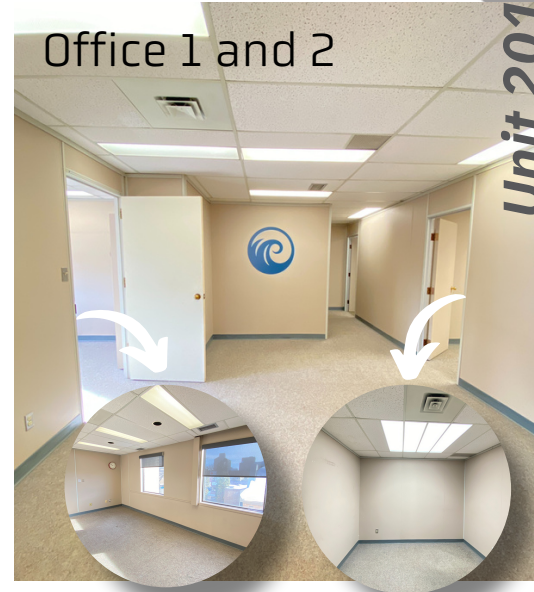
Office 1 and 2